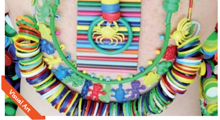
arty Girl, Mixed plastics, fibres, buttons, wearable proportions.