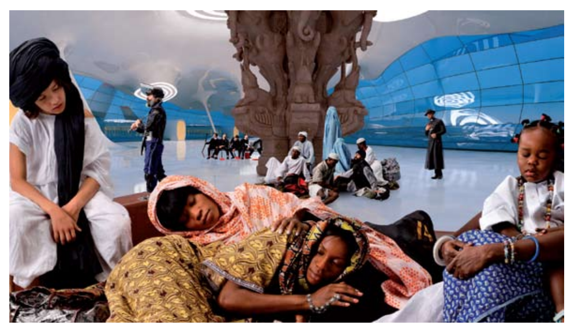
AES+F, Allegoria Sacra, 2011, video still image © AES+F Courtesy Triumph Gallery, Moscow