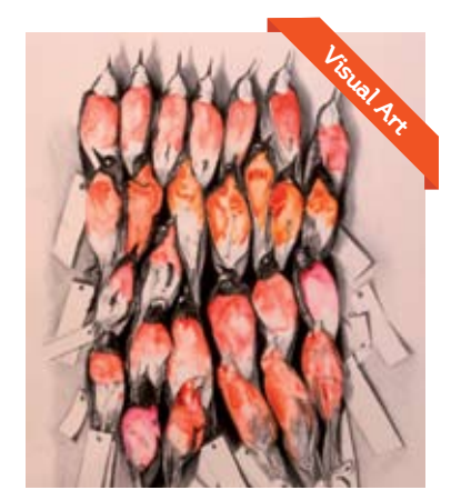
Rita Hall, Red Breasted Birds 2 (detail), Watercolour and charcoal on paper, 2008, 1284 x 964mm