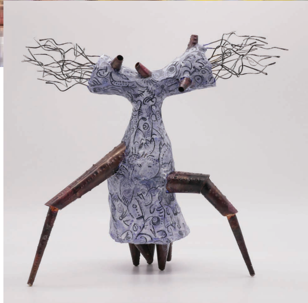
Simon Lowndsbrough, Study for Sculpture , 2022, Mild steel, copper, brass, paper, adhesive, acrylic, ink.

The Creative Communities Partnership Program lays the foundation for the employment of Arts & Cultural Facilitators to support and empower regional artists and communities to realise arts and cultural priorities and drive change through the arts.