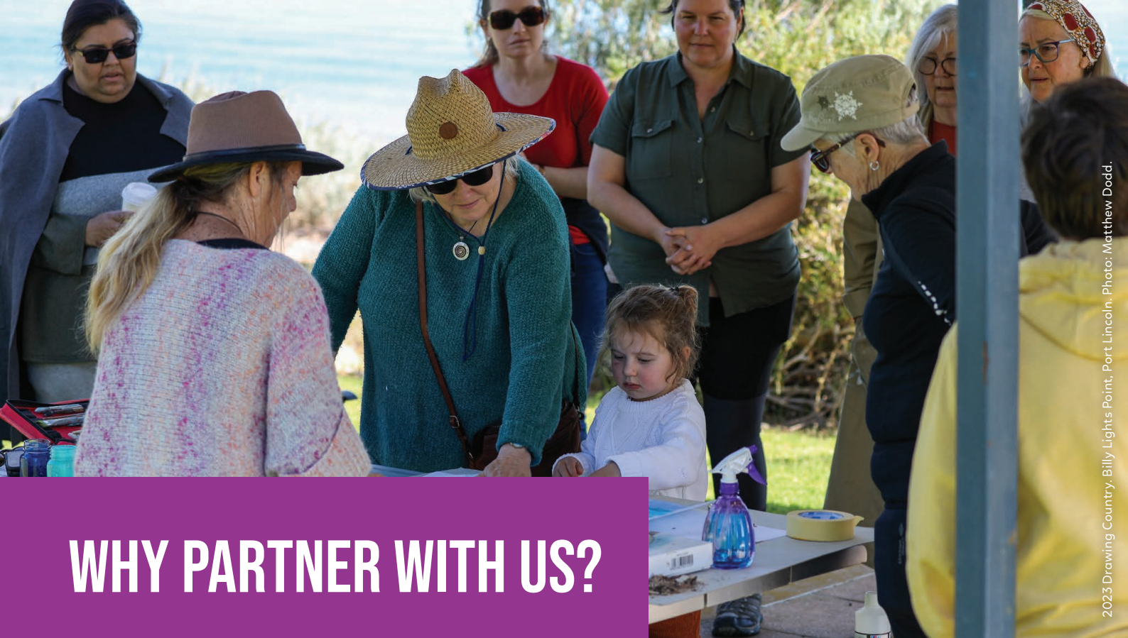
2023 Drawing Country, Billy Lights Point, Port Lincoln.