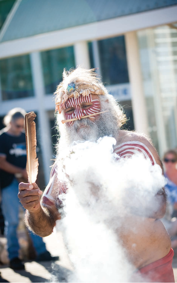
Just Add Water opening event.