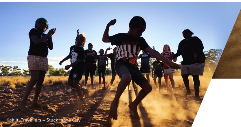
Kaltjiti Travellers – Stuck in the City

Nunga Screen – held between Reconciliation Week and NAIDOC Week – is a short film showcase that shares and celebrates First Nations culture, stories and language through film.