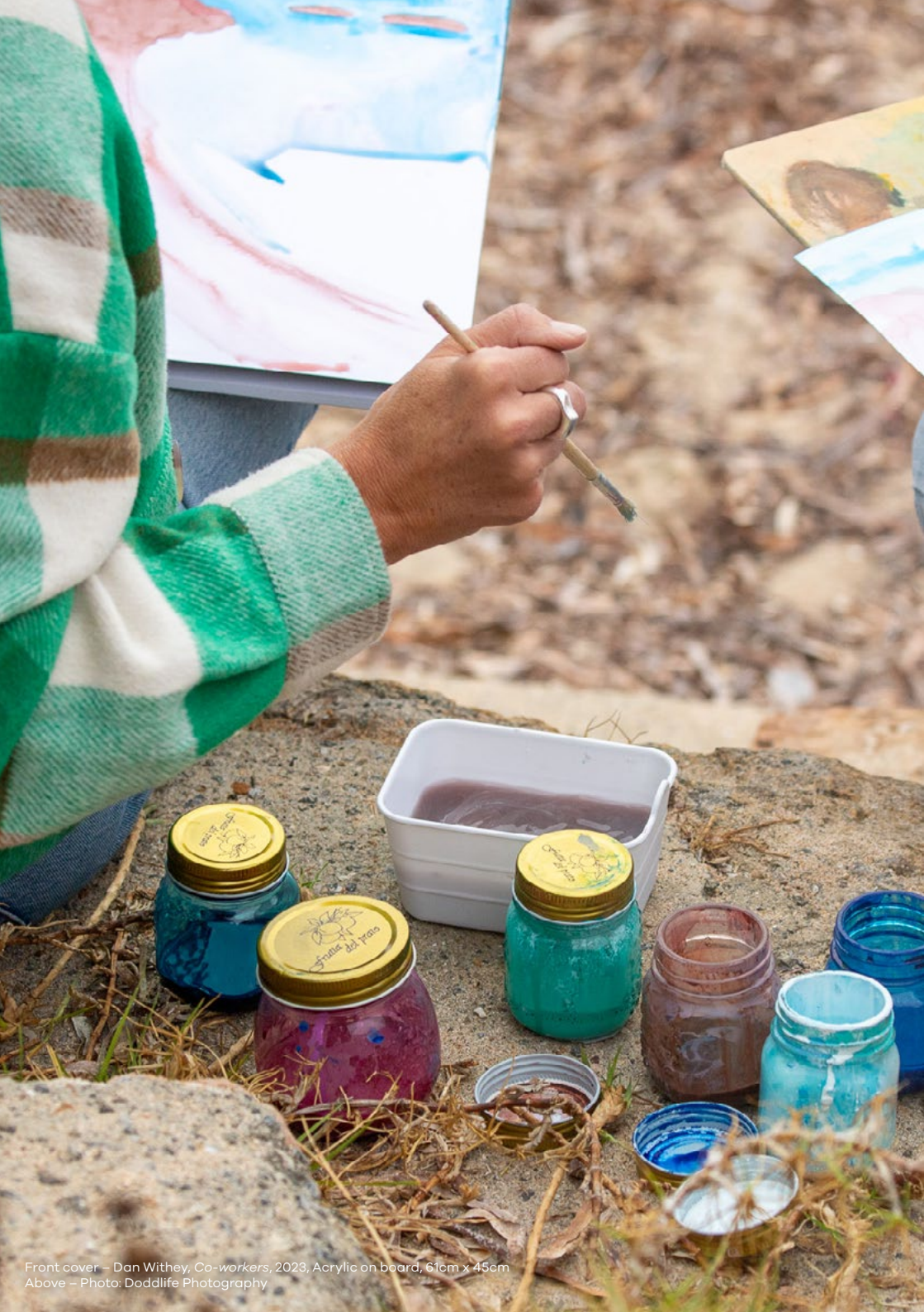
Front cover – Dan Withey, Co-workers , 2023, Acrylic on board, 61cm x 45cm Above – Photo: Doddlife Photography