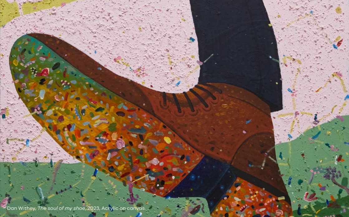
Dan Withey, The soul of my shoe , 2023, Acrylic on canvas.