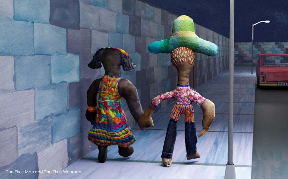
The Fix It Man and The Fix It Woman